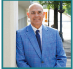
Bruce Thompson Commissioner of Labor

A handwritten signature in black ink, appearing to read 'B. Thompson'.