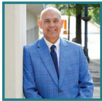
Bruce Thompson Commissioner of Labor